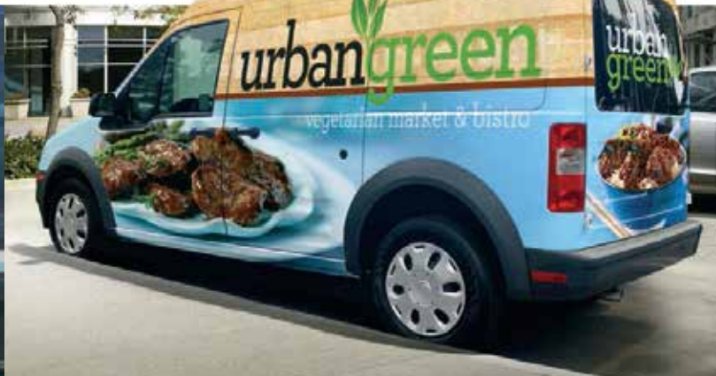
High Speed Printing Without Sacrificing Quality Ideal for impactful high-volume applications such as fleet vehicle graphics