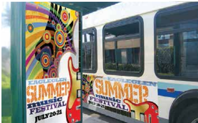
PANTONE ® Spot Color Libraries Direct support for best color matching on your profiled media

[12' x 2.5'] Partial Bus Wraps high-speed mode (323 sq ft/hr)