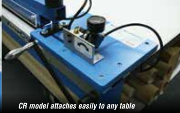
CR model attaches easily to any table