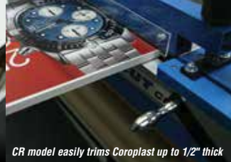
CR model easily trims Coroplast up to 1/2" thick