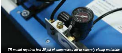
CR model requires just 35 psi of compressed air to securely clamp materials