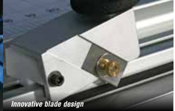
Innovative blade design